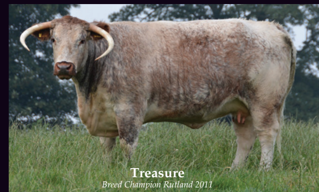
Treasure Breed Champion Rutland 2011