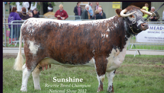
Sunshine Reserve Breed Champion National Show 2012