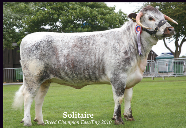
Solitaire Breed Champion East/Eng 2010