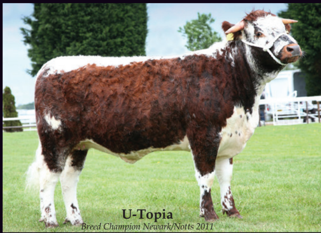
U-Topia Breed Champion Newark/Notts 2011