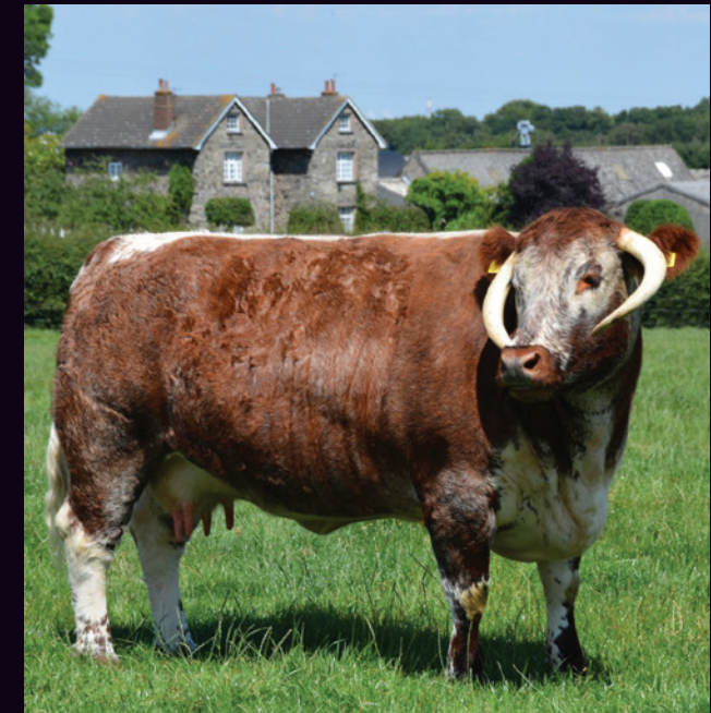
Blackbrook U-Wood Reserve Breed Champion Newark 2012