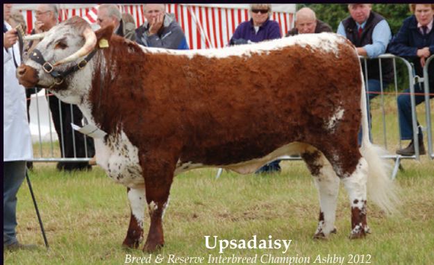
Upsadaisy Breed & Reserve Interbreed Champion Ashby 2012